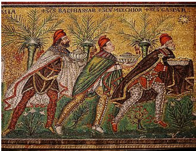
Ravenna , Italy: The Three Wise Men " (named Balthasar, Melchior, and Gaspar).

Hymn for Christmastide (tune: Once in Royal David's City)